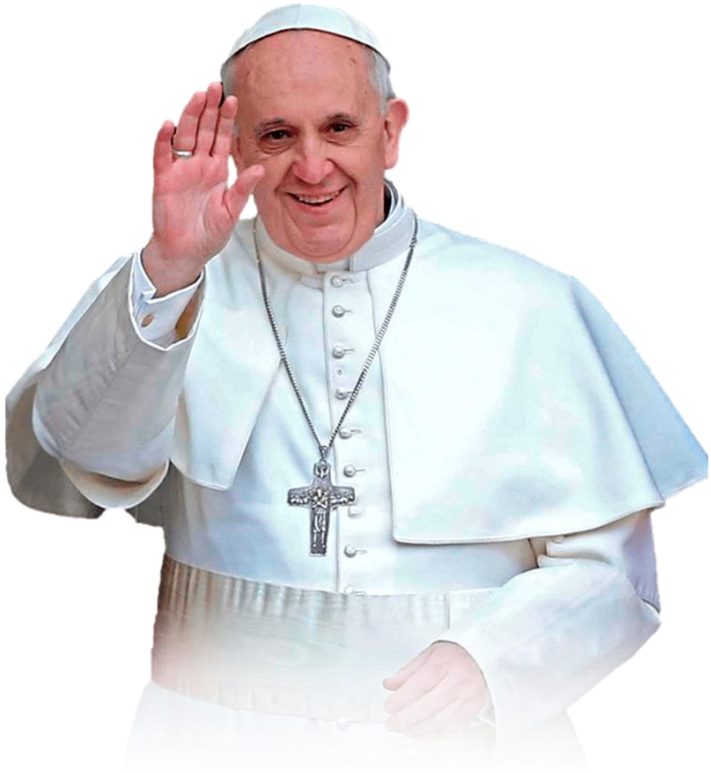
THE HOLY FATHER Pope Francis